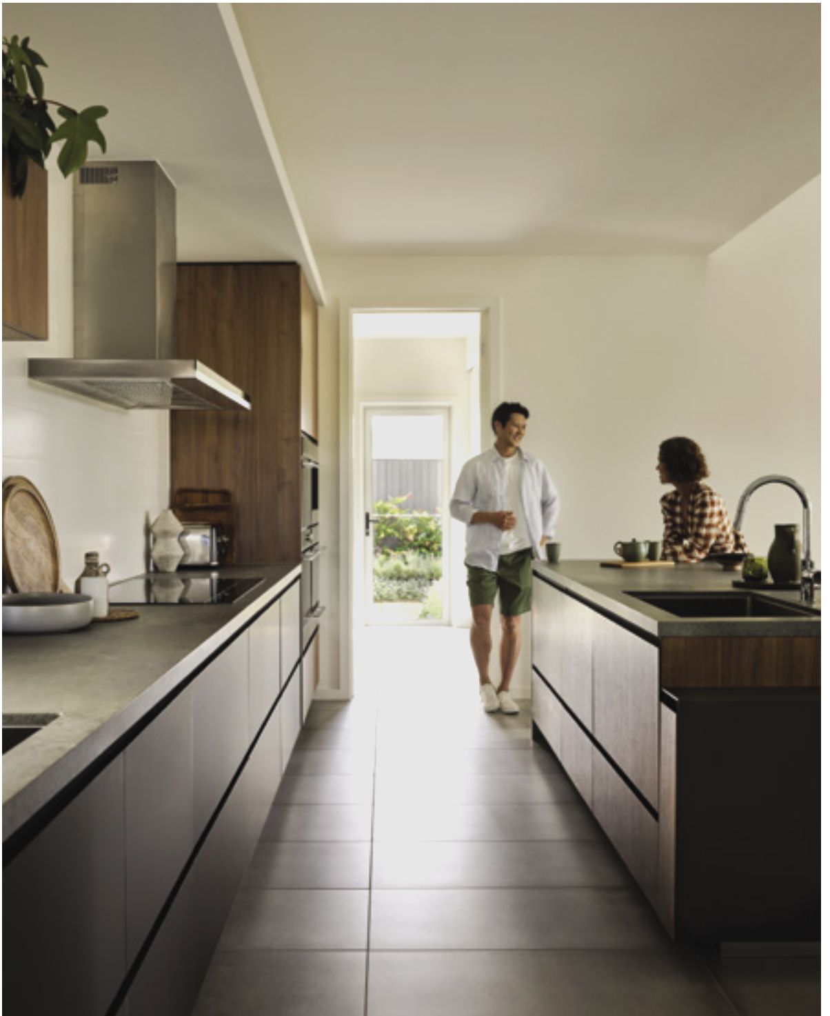
Above: Considered floorplans seamlessly blend indoor and outdoor environments.