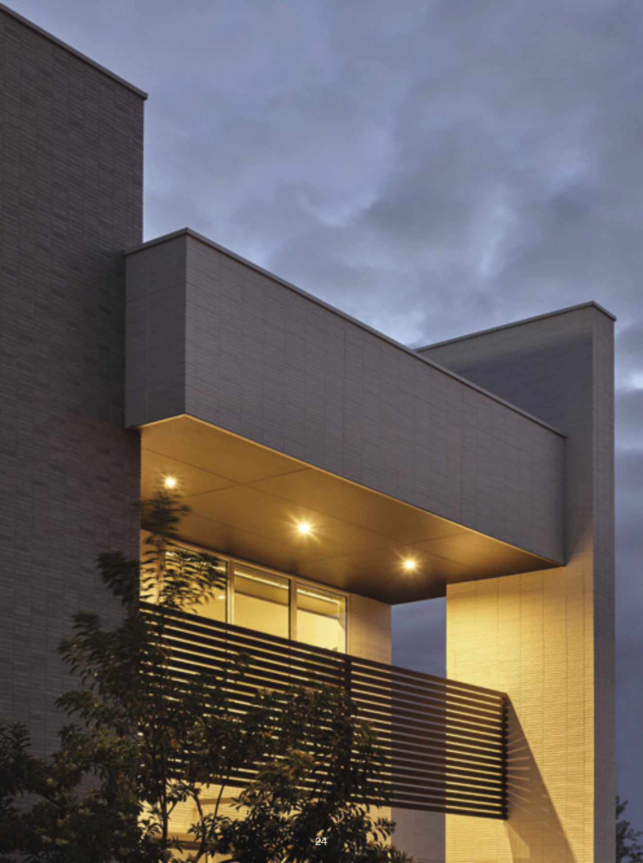
Image: Low maintenance – A nano-hydrophylic coating on the main facade means dust and grime simply washes away.